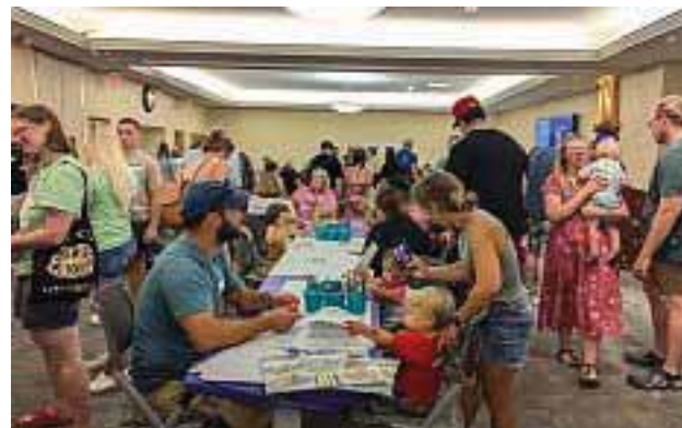
Sunday's festivities included a group photo, games, refreshments and the opportunity for families to mingle with the staff who cared for their babies in the NICU.