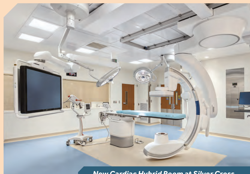
New Cardiac Hybrid Room at Silver Cross

For more information about heart care at Silver Cross, visit silvercross.org/heart